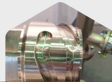
Easy to handle