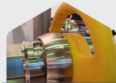
Push & turn – free flow