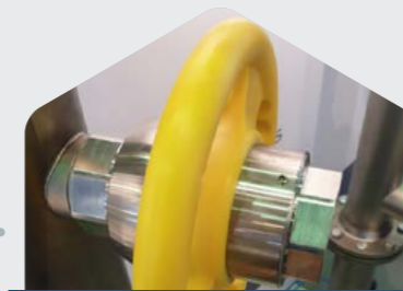
Turn and pull – closed